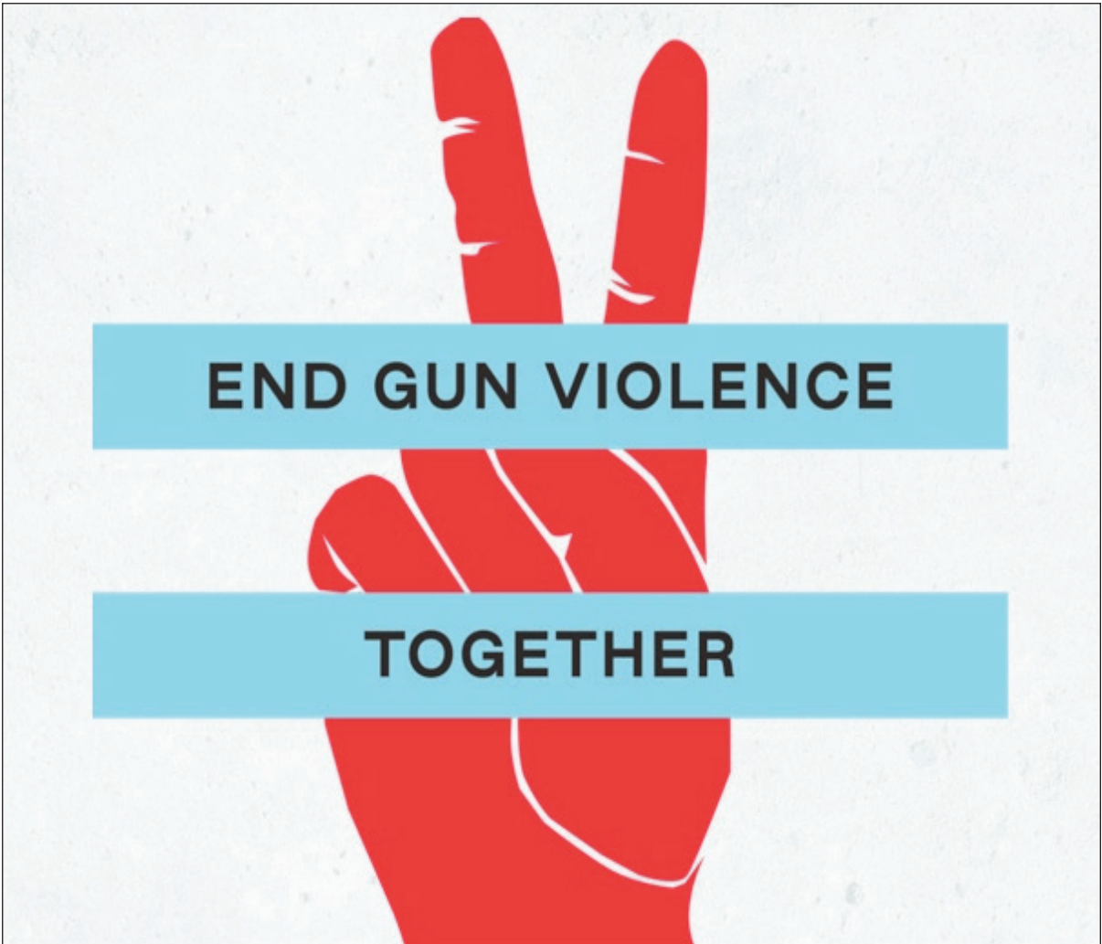
END- TOMS’ new campaign calls for an end to gun violence, thier website offers additional information.

on it has simply not been done yet. With 13,312 deaths from gun violence and 323 mass shootings, America has an issue that must be taken care of as too many have been affected by gun violence. With so many people begging for a call to action, something must be done. There is no room for anyone else to get hurt but it will absolutely continue until a change is made. The most recent group to get their stories heard on why gun violence must end are doctors. Doctors have shared their harrowing stories of bullet removal ending with the patient’s life being saved but also in tragedy where the patient did not survive. The hashtag #ThisIsMyLane started after the National Rifle Association tweeted and told doctors to stay in their lane when speaking out about gun violence. The thing is though, this is completely their lane because they are the ones dealing with the aftermath of gun violence. There is more than enough call to action from Americans who are all scared of what is coming next, the government needs to step up and take care of their people. Too many lives have been lost and continue to be lost the longer gun violence goes on.