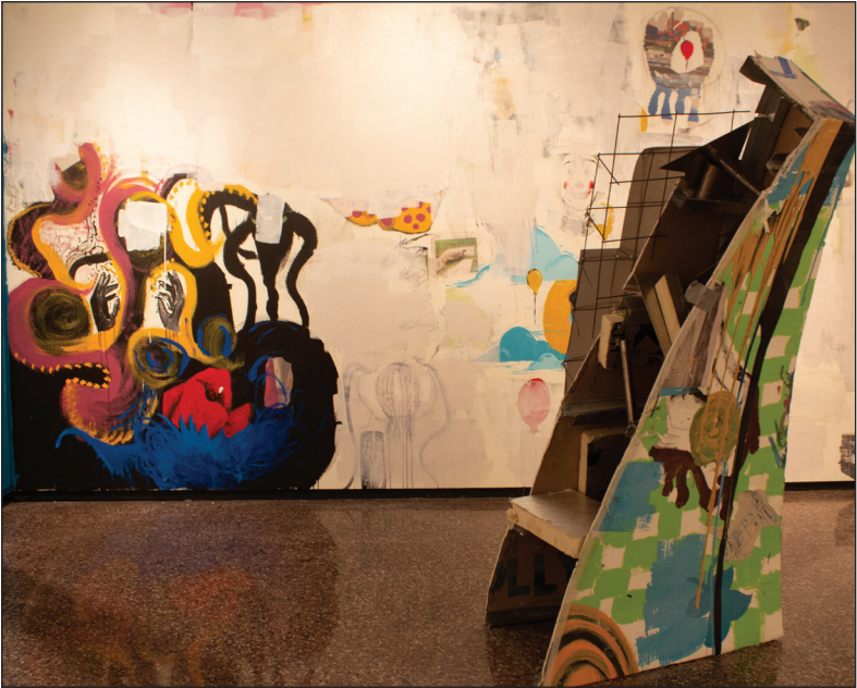
VALLEY STAR | MONSERRAT SOLIS CALUMA- Warped piece cut out of artwork stands next to canvas.