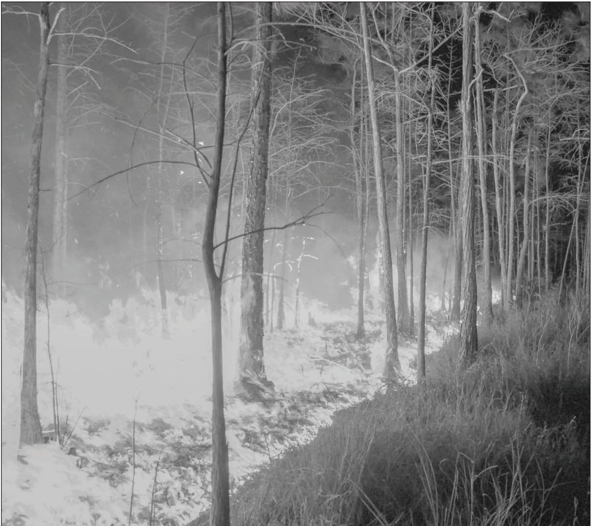
FlickR | U.S. Fish and Wildlife Service Southeast Region FIRE- Wildfires, flooding and other natural disasters are becoming more prevalent according to studies.

THE ISSUE Climate Change According to NASA, in the last 650,000 years there have been seven cycles of glacial advance and retreat marking the beginning of the modern climate era– and the end of human civilization.