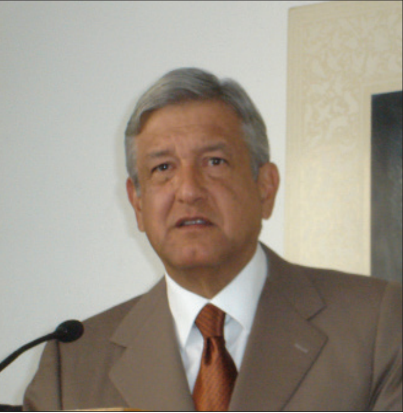
OBRADOR- Mexico has its next President, promising change.

After seven decades of corruption and poverty, a leftist is sworn into the office of president with plans to bring change to the country.