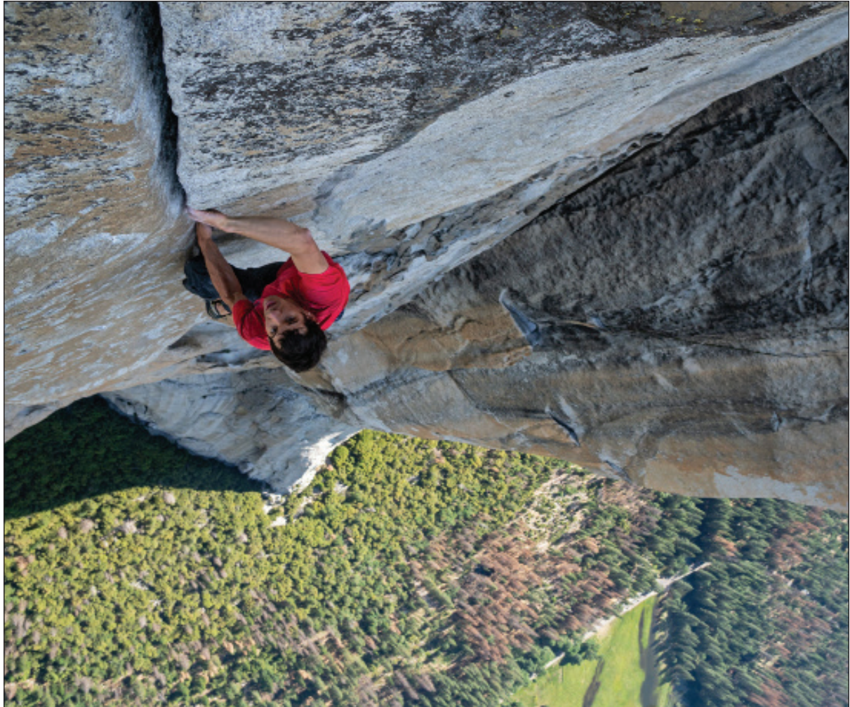
Alex Honnold became the only person to climb the summit of El Capitan without a rope.

McCandless, added emotional weight to the documentary as she copes with the anxiety of Honnold’s love for harness-less climbing. The documentary did a great job reflecting the tense and nerve-racking ride for everyone involved. The film is also shot masterfully, giving the audience a true sense of the scale and scope of free soloing. There are some shots while Honnold is climbing that is so visceral, it feels as if you are up there with him. It does a superb job evoking a sense of vertigo making it all the more impressive, yet nail-biting to watch. It was an incredible documentary to witness, one that can be enjoyed and appreciated by people who aren’t big fans of rock climbing. Hats off to Honnold and everyone involved in the stressful production of this film.