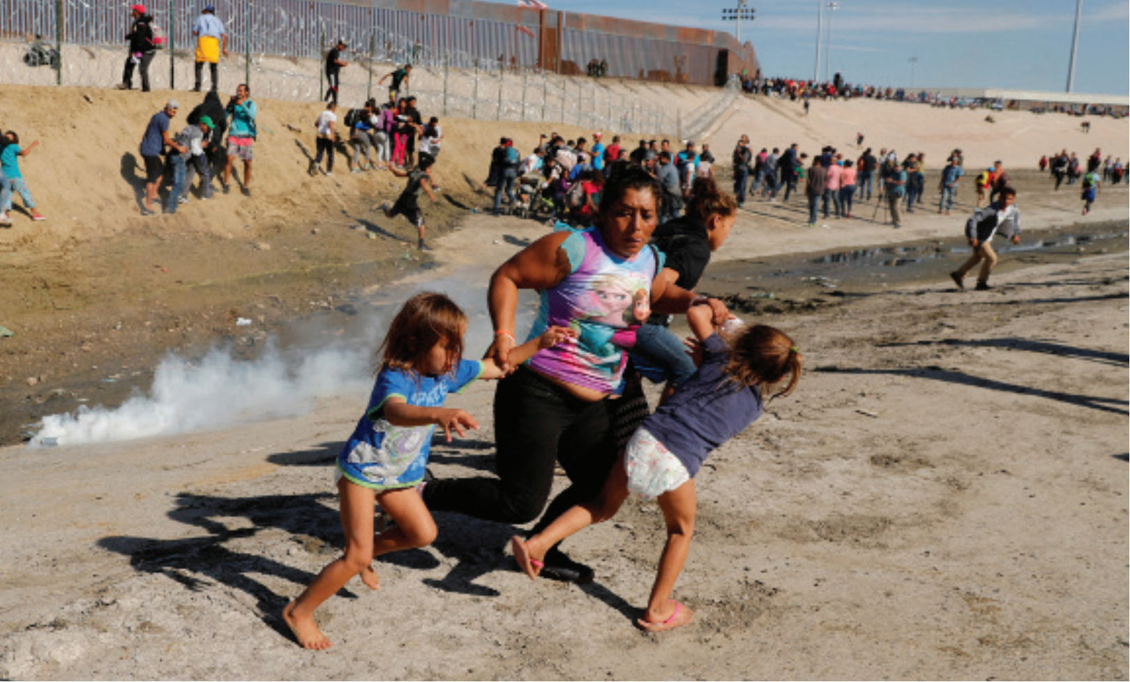
RUFUGEES- Border security agents fired tear gas at defenseless fleeing homeless immigrants on the Mexican/American border.

The Trump Administration’s lack of compassion towards refugees has made a difficult situation at the border into an international humanitarian crisis.